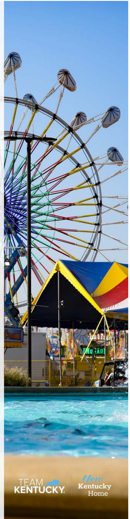
Governor Andy Beshear 63 rd Governor of the Commonwealth of Kentucky